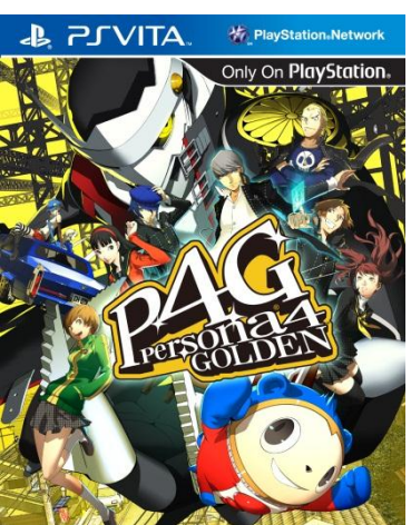
Package art not finalized