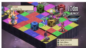
Disgaea 3: Absence of Justice

(Originally released on October 8, 2013 for the PlayStation®3.)