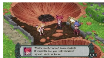
Disgaea D2: A Brighter Darkness