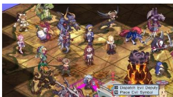
Disgaea 4: A Promise Unforgotten